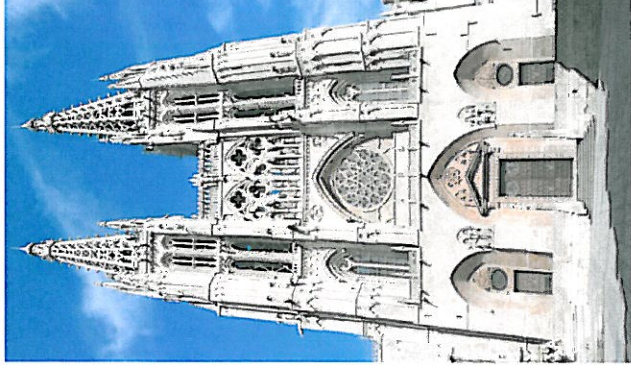
Catedral de Santa María Catedral de Burgos